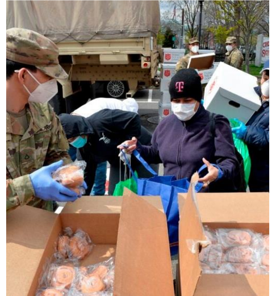
Caption: “MEMA and the National Guard brought hundreds of boxes of food to Chelsea on April 16, 2020.”